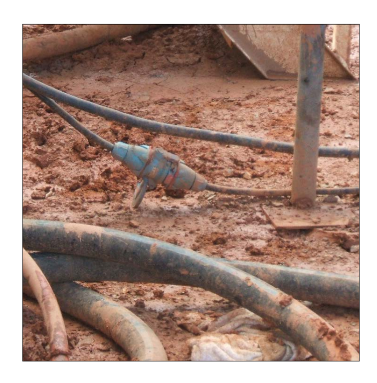
Adverse conditions include water, mud, and temperature extremes, yet the Switch-Rated plugs continue to operate reliably since installation.