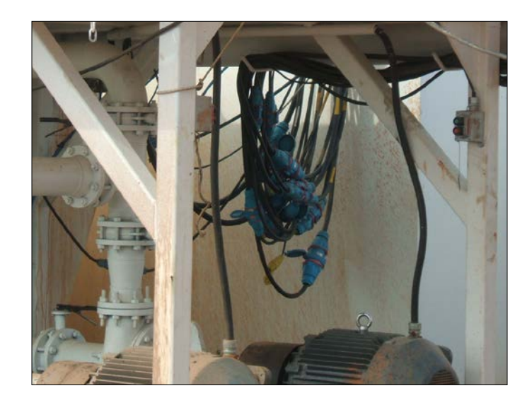
Electrical motors that operate on 440 VAC are among the equipment connected with the Switch-Rated plugs, which can be seen above.

The Switch-Rated devices incorporate spring-loaded, silver-nickel butt-style contacts that provide consistently superior electrical performance over thousands of operations. They are resistant to wear, corrosion, oxidation, and other factors that contributed to premature failure of the pin and sleeve-type devices.