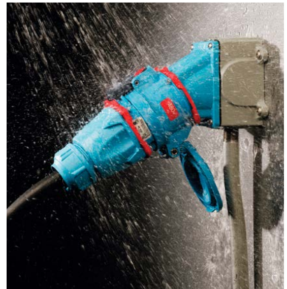
MELTRIC Switch-Rated plugs and receptacles are Type 4X, providing a watertight connection for washing down production equipment.