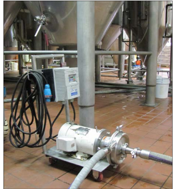
Founders Brewery uses MELTRIC Switch-Rated plugs and receptacles on brewery production equipment such as mobile pump carts, keg washers, motors and other portable equipment. Any qualified worker can connect or disconnect a plug. Making and breaking connections with Switch-Rated plugs is a Risk Category '0' operation, so the need for cumbersome PPE when working near live parts is eliminated.

Making and breaking connections with MELTRIC plugs is a quick and easy operation since the work is done by the integral spring-loaded mechanism instead of the user's physical motion, which is typical of pin-and sleeve or twist-type plugs. In MELTRIC plugs, the circuit is opened by simply depressing the pawl, which releases the energy in the spring-loaded operating mechanism,