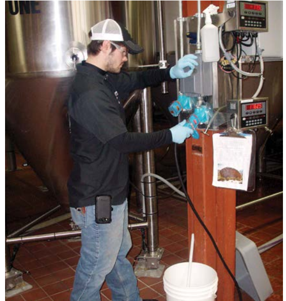
MELTRIC Switch-Rated plugs have a modular design and flexible mounting accessories allowing them to be used in a variety of configurations including, in-line, cord drop, or wall mounting. MELTRIC Switch-Rated connectors are UL/CSA rated for motor and branch circuit disconnect switching. They meet NEC line of sight motor disconnect switching requirements.

To put this into perspective, many breweries use pin-and-sleeve, twist-lock, or bladed-style electrical plugs to connect brewery equipment to electrical power. Not only are these types of plugs more expensive, they can pose electrical safety hazards for brewery workers