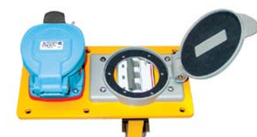
Breaker Plate Assembly