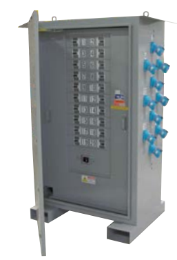
Custom Panel Solutions