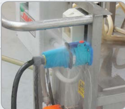
DS and DSN Series plugs achieve rated watertightness up to Type 4X as soon as the plug is latched to the receptacle.

Protective plug caps are the best way to keep the plug dry when not in use or during washdowns.