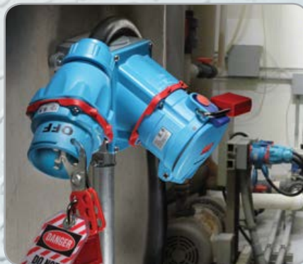
DSN/ DS plugs can be locked in the disconnected position and an optional pawl enables locking of the receptacles.