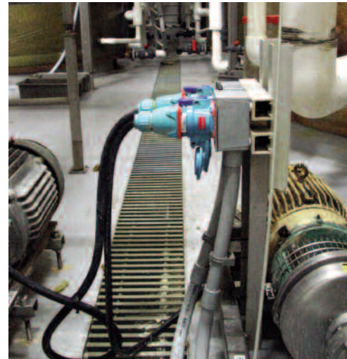
Pump motors such as these 7-1/2 hp units are easy to disconnect using the Meltric Decontactors.

Project Engineer Arland Wingate points out that the company does not hard-wire most pumps and conveyors because being able to quickly disconnect and reconnect equipment for repair or replacement helps to minimize downtime. Electrical safety during equipment change-outs used to be a concern but is less so now because the Decontactors' safety shutter and internal arc chambers prevent exposure to live parts and arc flash. The new plant provided an opportunity to upgrade and standardize on the Deconnector plugs and receptacles. Wingate explains, "When I first saw them, I thought they would work well for us, but we weren't ready to change