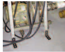
Four Decontactors provide power to individual pumps used to empty the holding tanks that hold four separate sizes of pickles.

Wingate reports that the company is planning to triple the size of its tank yard soon and will convert it to the Decontactors as part of the project. “We will use them on pumps and conveyors, and also the low-pressure blowers we use to help move product along,” he adds.