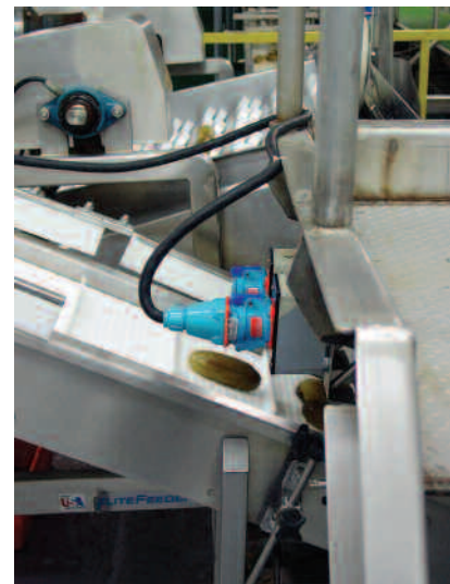
Deconnector plugs feature an OFF switch/pawl which can be used as an emergency disconnect switch for conveyors.