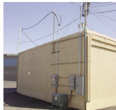
Previously, conduit and overhead wires like this had to be removed each time a building was moved, then new ones cut and installed at the next location.

Each time a building is moved, electrical power must be disconnected and reconnected at the new location. Previously, this entailed disconnecting all the wiring and conduit before moving a building and again repeating the process once the buildings are in place at their new location. Typically, it takes one or two journeyman electricians eight hours or more to run all of the needed conduit and wiring to reconnect one modular building. Mr. Crocker worked with Matt Guild of Nedco Supply, Las Vegas, to implement a better way to make these connections.