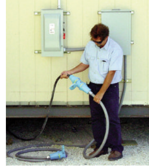
Compared to hard wiring, connecting the switch-rated plugs and receptacles on the extension cord that runs power to the opposite side of a portable building is safer, faster and easier.

Disconnecting a classroom is a simple operation that is initiated by pressing a pawl on the Decontactor, which causes it to break the circuit and eject the plug to its rest position. Then, a simple quarter-turn of the plug allows it to be totally withdrawn from the receptacle in complete-safety, since the circuit is already dead. While the plug and receptacle are separated, electrical safety is ensured because a safety shutter on the receptacle prevents access to live parts.