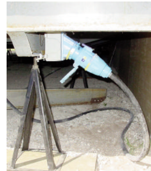
A male inlet is installed at the mobile classroom corner opposite the panel. The female connector is easily mated to the inlet providing a safe and neat power connection.

To date, approximately 350 of the portable buildings have been equipped, with more than 100 additional devices ordered. Looking to the future, the District now is ordering all new portable buildings to be equipped with the Decontactors. Mr. Crocker says, "They will be pre-wired at the factory, so all we have to do before we plug them in is to check to see they are wired properly."