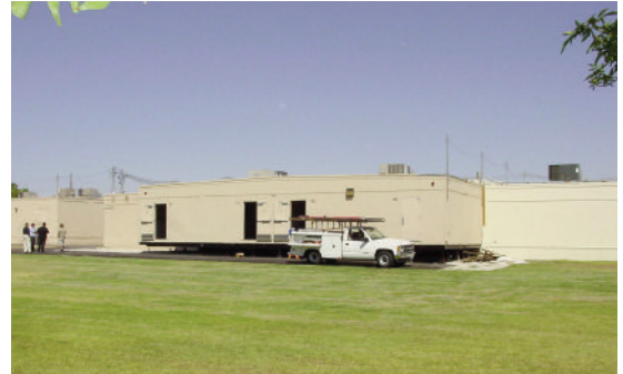
Mobile classroom buildings such as this one being set up at Elaine Wynn Elementary School are easier to move since the Clark County, Nevada School system started using Meltric switch-rated plugs and receptacles instead of hard wiring electrical power