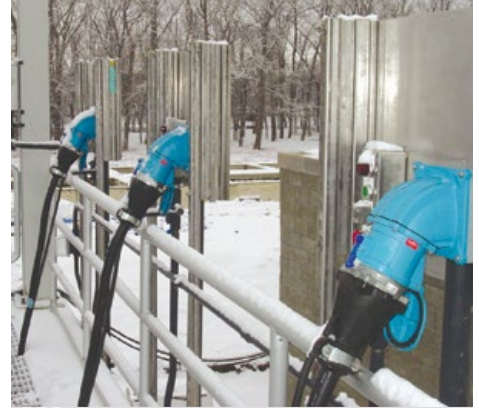
Electrical connections to submersible pumps for effluent water. Using a Deconnector instead of a hardwired connection improved pump maintenance efficiency.

All Deconnectors have dead front construction, enclosed arc chambers and a short circuit, "make and withstand" rating of at least 65kA. The dead front prevents user access to live parts and the short circuit rating ensures safety during insertion, even under overload or locked rotor conditions.