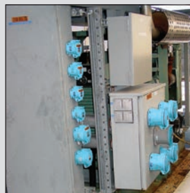
Meltric plugs and receptacles ensure arc flash safety and simplify NFPA 70E compliance