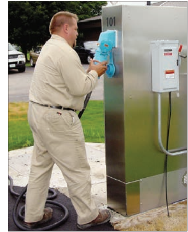
Making 100A generator connections at a lift station in Watertown, WI.