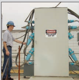
Meltric plugs and receptacles are durable in harsh environments.