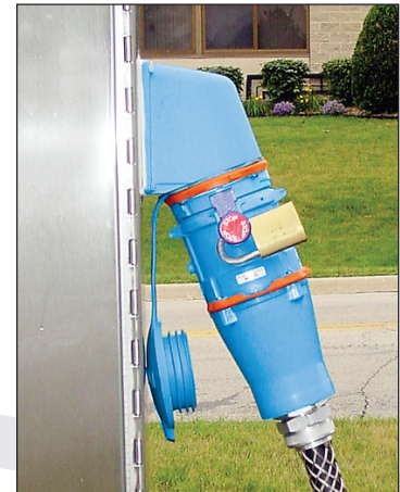
During test runs the plug is locked in the connected position to prevent injury to unauthorized people who might try to remove it.