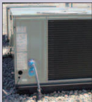
AIR HANDLING UNITS