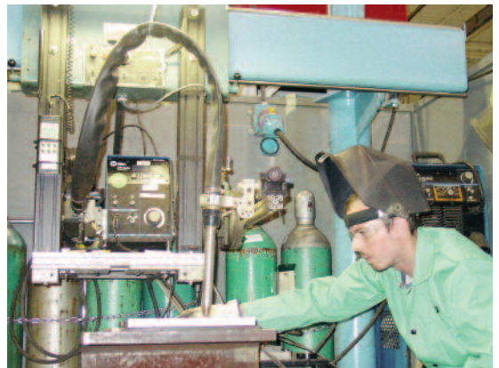
EWI Technician sets up a gas metal arc welding torch powered via a switch rated Deconnector plug and receptacle.