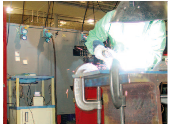
Three switch-rated welder receptacles provide power for Gas Metal Arc Welding in a EWI work cell.

Instead, Joseph selected Meltric's Decontactor Series switch rated plugs and receptacles, which combine the two functions. Now with Decontactors installed at more than 100 locations in the lab, disconnecting power is a