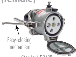
Standard DR400 lid opens to 90°