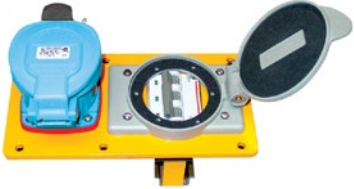
Breaker Plate Assembly