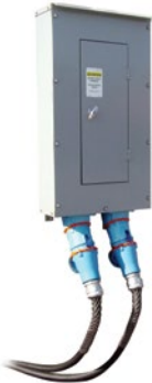
Wall Mounted Panel Assembly