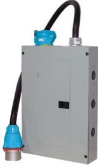
Portable Panel Assembly