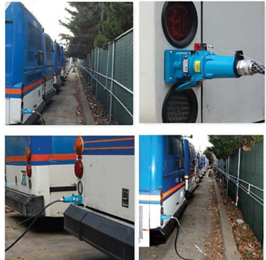
After installing MELTRIC self-ejecting plugs and connectors on its bus fleet, UVA at Charlottesville experienced a steep decline in power plug runaway accidents.

The potential for personnel hazards or equipment damage is created when a truck, bus, or other type of mobile vehicle drives away prior to having its power plug manually disconnected from electrical power. Personnel hazards and equipment damage are eliminated when a mobile vehicle