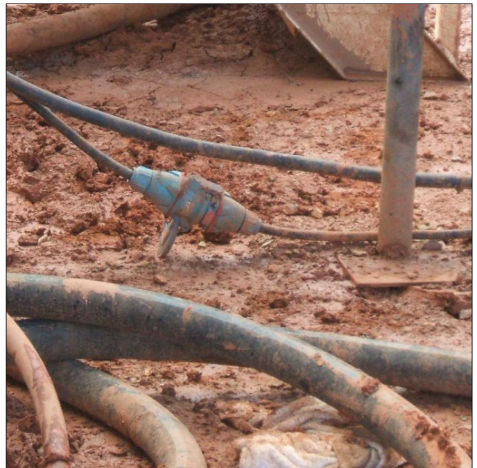
Adverse conditions include water, mud, and temperature extremes, yet the Switch-Rated plugs continue to operate reliably since installation.