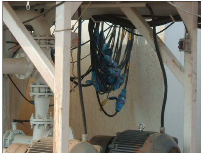
Electrical motors that operate on 440 VAC are among the equipment connected with the Switch-Rated plugs, which can be seen above.

The Switch-Rated devices incorporate spring-loaded, silver-nickel butt-style contacts that provide consistently superior electrical performance over thousands of operations. They are resistant to wear, corrosion, oxidation, and other factors that contributed to premature failure of the pin and sleeve-type devices.