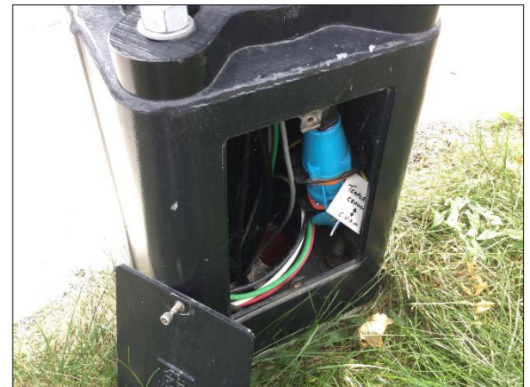
A special box was built by Trelec to install the DSN60. This box goes between the concrete base and the pole.